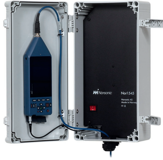
Figure 1: Nor1545

Two configurable inputs actions and one digital output are also available.