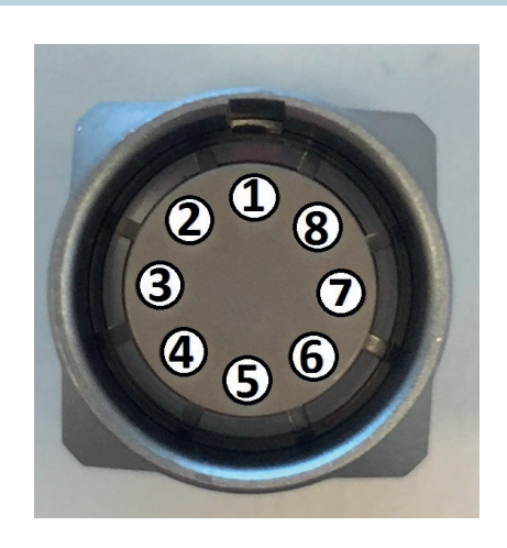
Figure 5: Weather station connection. Terminal block (left), and Lemo connector (option 1 - right)