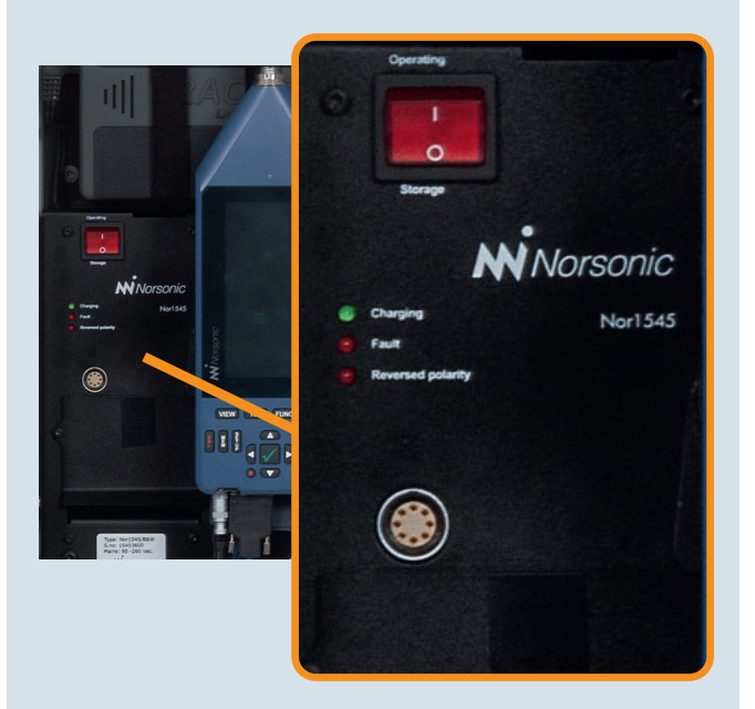
Figure 3: Status LEDs and Operating swich

For storage, turn the OPERATING switch to 0 and then disconnect the Tracer battery. If not, a small current will flow and empty the battery. This can damage the battery.